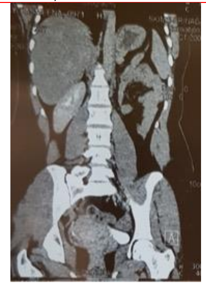
Fig 1: High Resolution image of Renal Ectopia